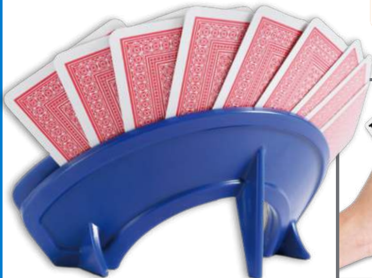
PLAYING CARDS HOLDER